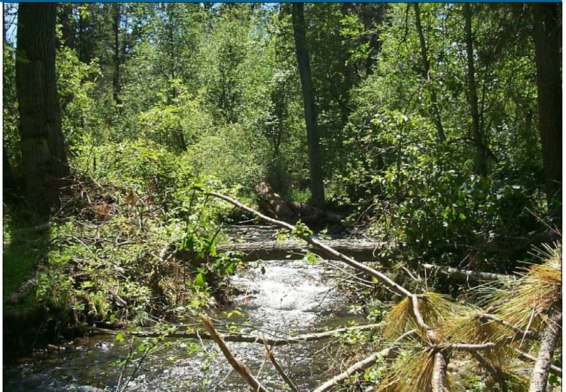
Example of a large-wood riparian project in NE Oregon (ODF)