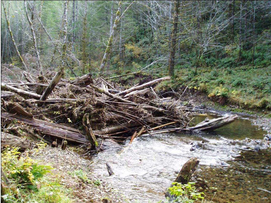
Example of a large-wood placement riparian project in western Oregon (ODFW)