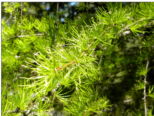
Christine Buhl, ODF

Tree mortality from larch casebearer is generally rare, although young trees growing in the open or along forest edges can be killed. Western larch is relatively tolerant of casebearer defoliation, and will often send out a second flush of needles in late summer. After five or more years of severe defoliation, annual terminal and radial growth may be seriously reduced. Cone production may also decrease enough to affect natural regeneration occurring at affected sites.